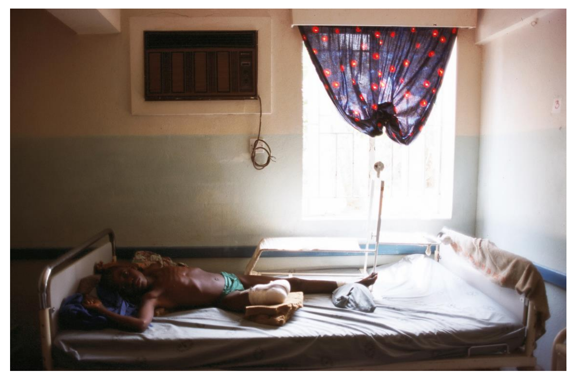
A boy injured during violence that targeted the capital lies in a hospital bed in Freetown, January 1999. Some war survivors told Amnesty International that during their extended stays in hospitals, medical staff provided some psychological support and clerics visited and offered words of encouragement.