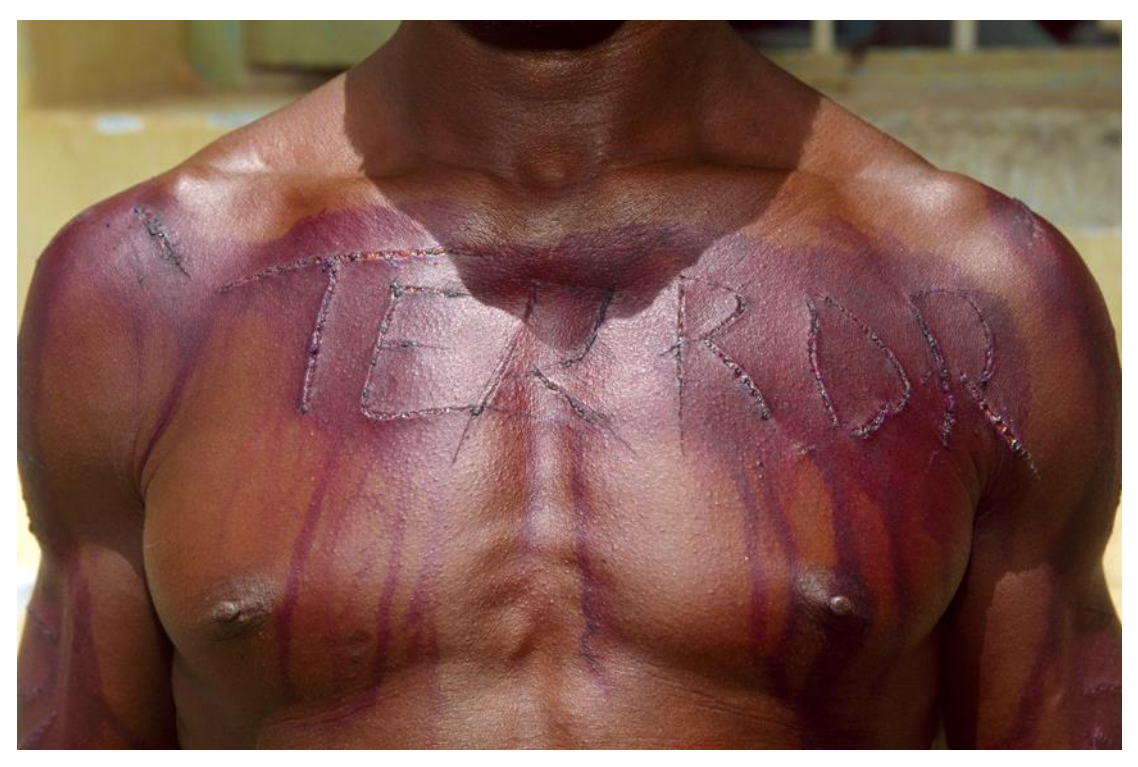
This photo from 16 April 1996 shows one of many civilians who were mutilated by members of the Revolutionary United Front (RUF). The war was characterized by acts of violence against civilians perpetrated in a pattern purposefully designed to inflict widespread terror.