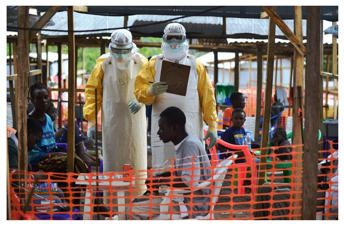
Health workers in protective gear are photographed alongside patients, 15 August 2014, at a Médecins Sans Frontières (MSF) facility in Kailahun, one of the districts hardest-hit by Ebola. Ebola survivors who told Amnesty International that they had received counselling during the crisis said it was provided by government mental health nurses and a variety of structured interventions from NGOs, including MSF.

Outside formal structures, several people interviewed said encouragement, support and acceptance from their families in the aftermath of their traumatic experiences were key in helping with their mental health and psychosocial wellbeing. For example, a man who lost a leg and sight in one eye due to a landmine explosion during the war said his wife's support brought him back from the brink after he had gone into isolation and considered ending his life.<sup>108</sup> This is reinforced by one of the core findings of a landmark 15-year longitudinal study on the mental health of male and female children formerly associated with armed forces and armed groups in Sierra Leone: that families' and communities' acceptance—or lack thereof—has been central in influencing their long-term mental health trajectories.<sup>109</sup>